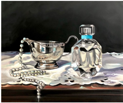
Title: Tiffany & Co. Size: 16 x 20 Medium: Oil on Canvas

Recently received the honour of earning her AFCA designation with the Federation of Canadian Artists. After being accepted earlier this year into the Society of Canadian Artists, she may now use both AFCA and SCA designation after her name.