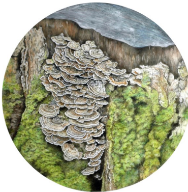
Title: Turkey Tail Fungus - Trametes versicolor Size: 18" x 18" framed Medium: Coloured pencil on mylar

Was honoured to have her work accepted into the Colour and Form Society 69th Annual Open Juried Exhibition. This year the judges selected 108 pieces from the 330 artworks submitted by 184 artists. The exhibition can be seen from October 15 to December 31 on their website www.colourandformsociety.org