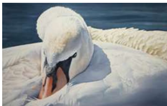
Down Comfort watercolour on paper 22" x 30"