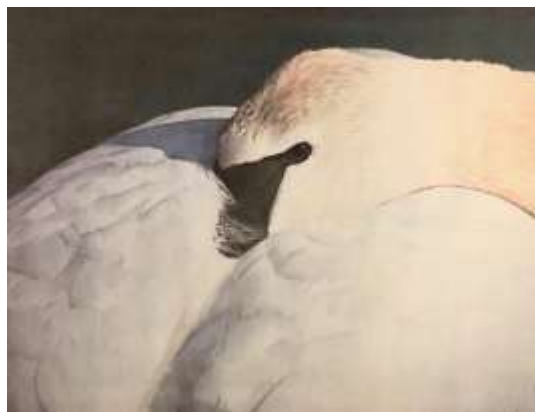
The White Queen watercolour on paper 22x30