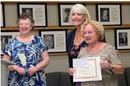
"An enjoyable function of the President is to hand out prizes at juried shows like Crossection along with the Past President."