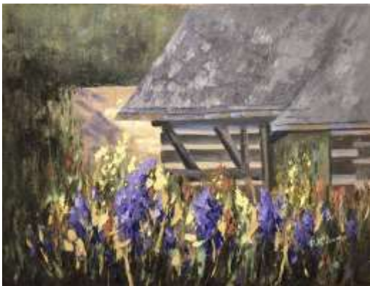
Cabin Fever oil - 16" x 20"