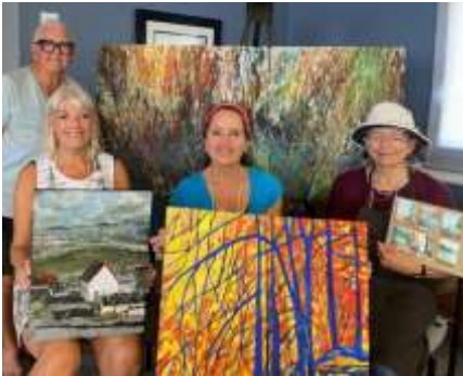
The group of independent painters produced lovely artwork in the Glyde Hall.

The weather could not have been better. Our instructors were excellent, meals wonderful and the setting at the Bayview Wildwood Resort was as lovely as ever. What more could we ask for! Twenty eight artists enjoyed a fantastic weekend. We were three groups.